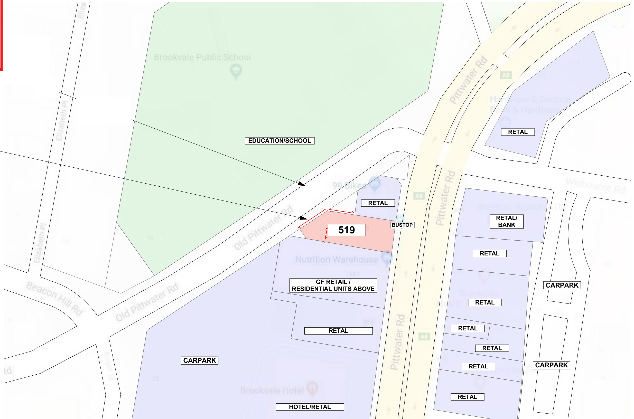
SITE ANALYSIS PLAN