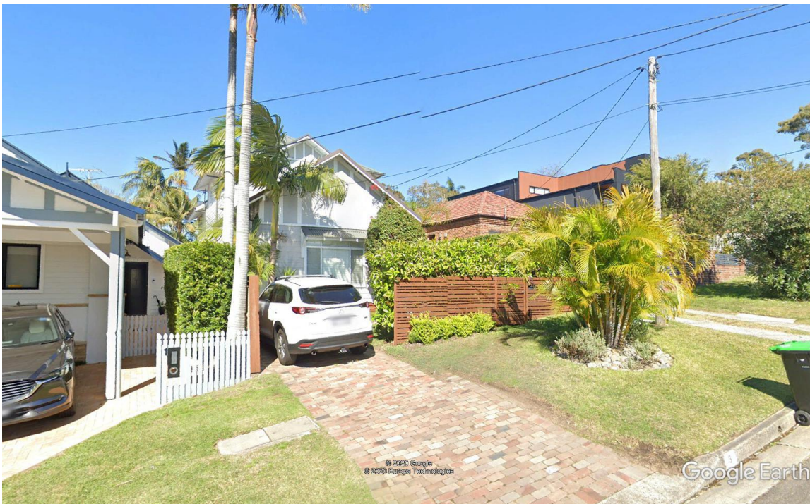
View of No 3 Peacock Street

The proposed upper level addition on the subject site is proposed to be contained over the existing dwelling footprint running along the common boundary. Overshadowing and privacy considerations are well resolved