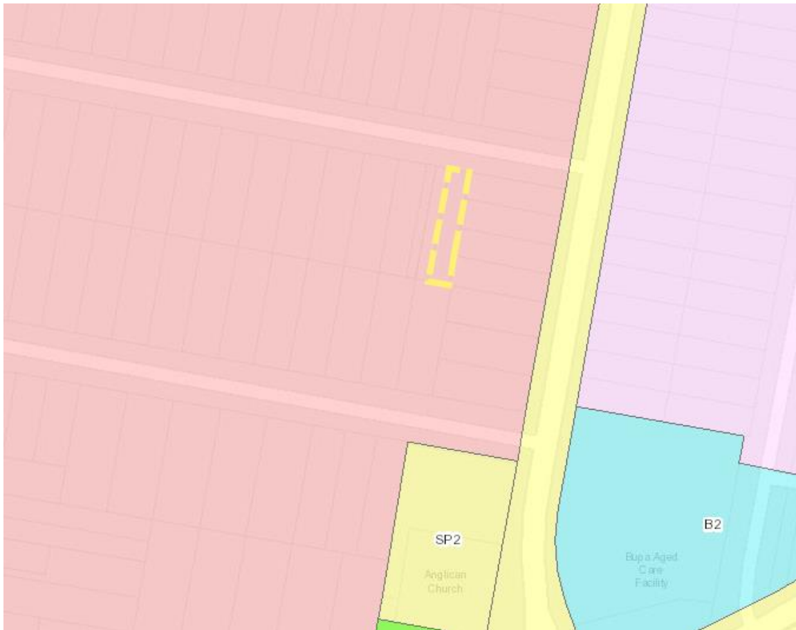
Zoning Extract – MANLY LEP 2013

Alterations and additions are ancillary to a dwelling and is permissible in the zone.