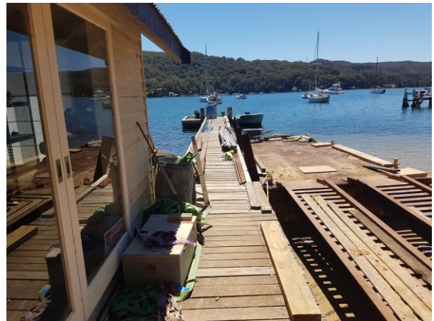
Existing jetty, looking NW