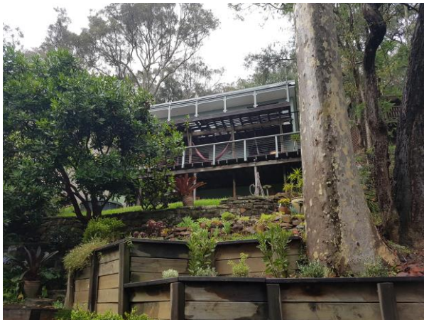
Adjacent residence to the SE