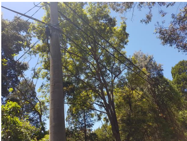
Electrical supply connection point