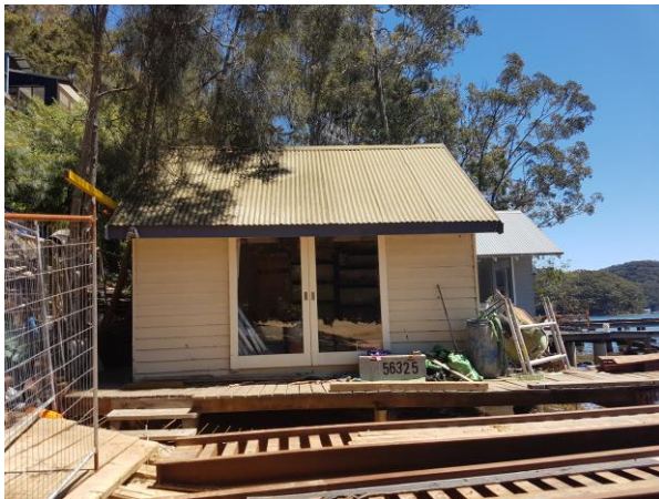
Existing boat shed, looking SW