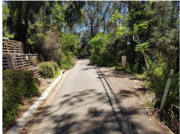
Robertson Road, looking W