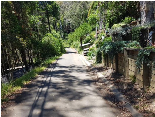
Robertson Road, looking E