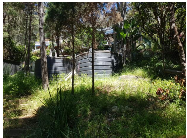
Existing / retained water tanks