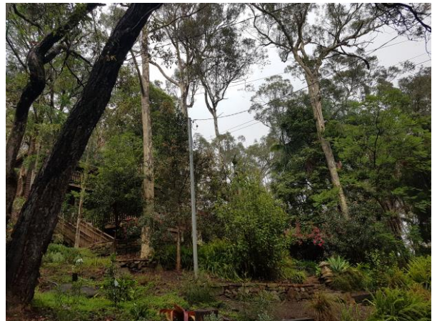
Adjacent residence to the SW