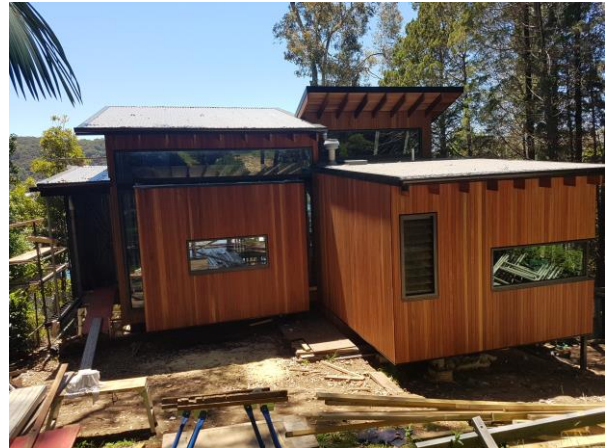
New residence, under construction