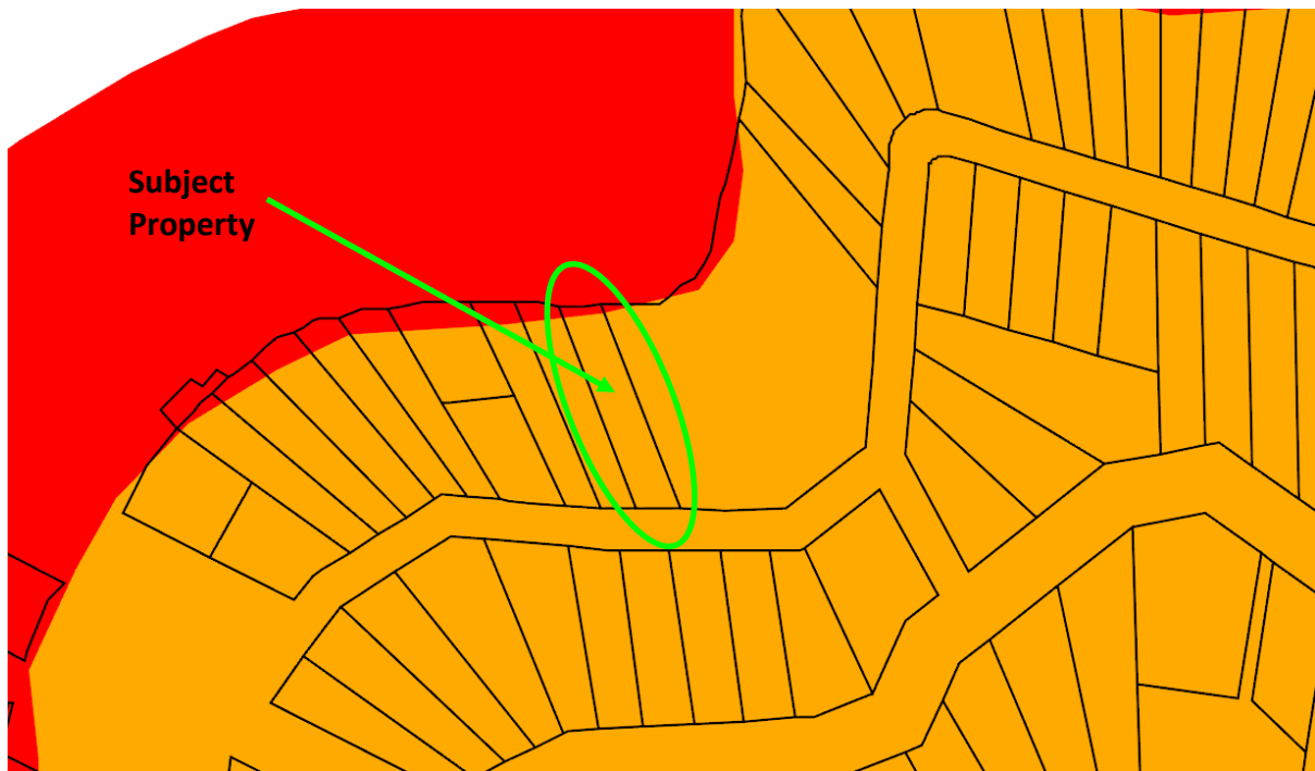
Extract Pittwater LGA Bushfire Prone Land Map