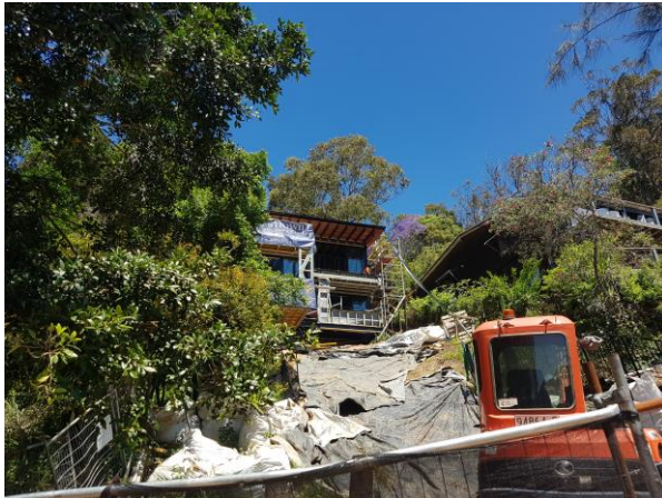
New residence, under construction