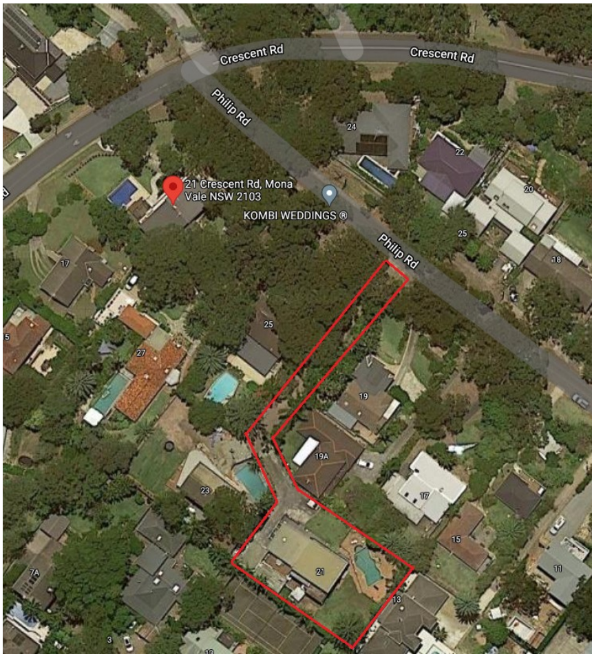
21 Crescent Road - Site Locality 21 Philip Road - Site Satellite