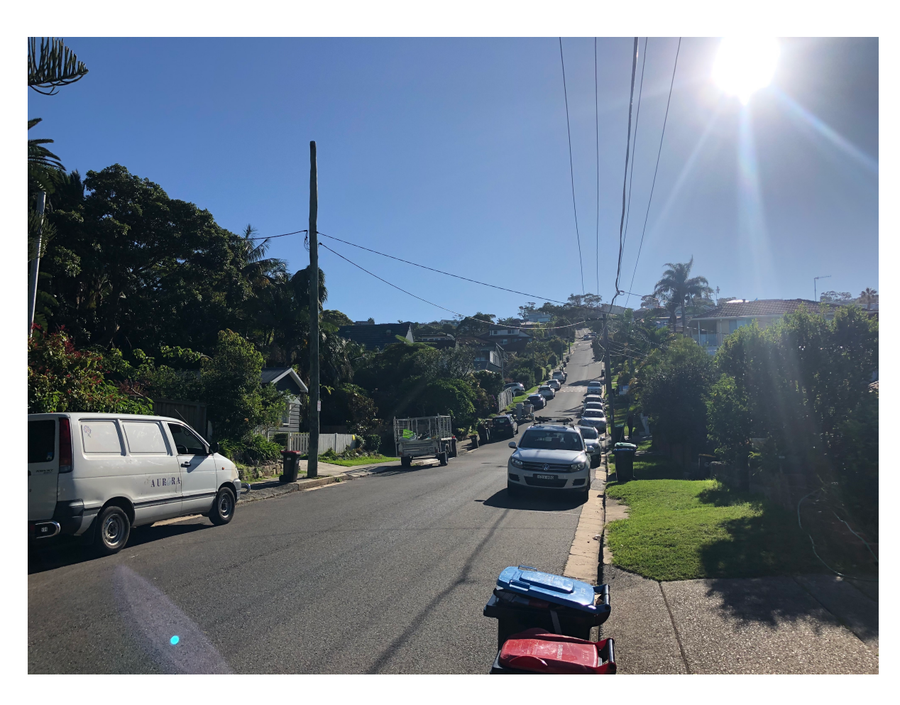
Figure 2: Streetscape view along Alexander Street, looking west