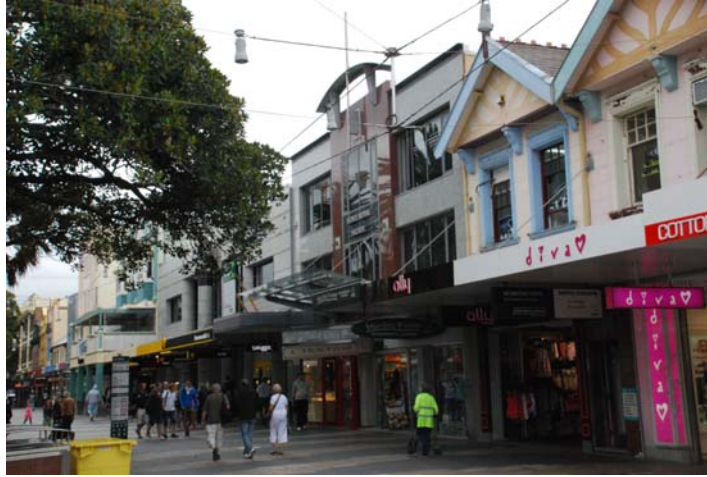
The Corso, a successful blend of old and new development