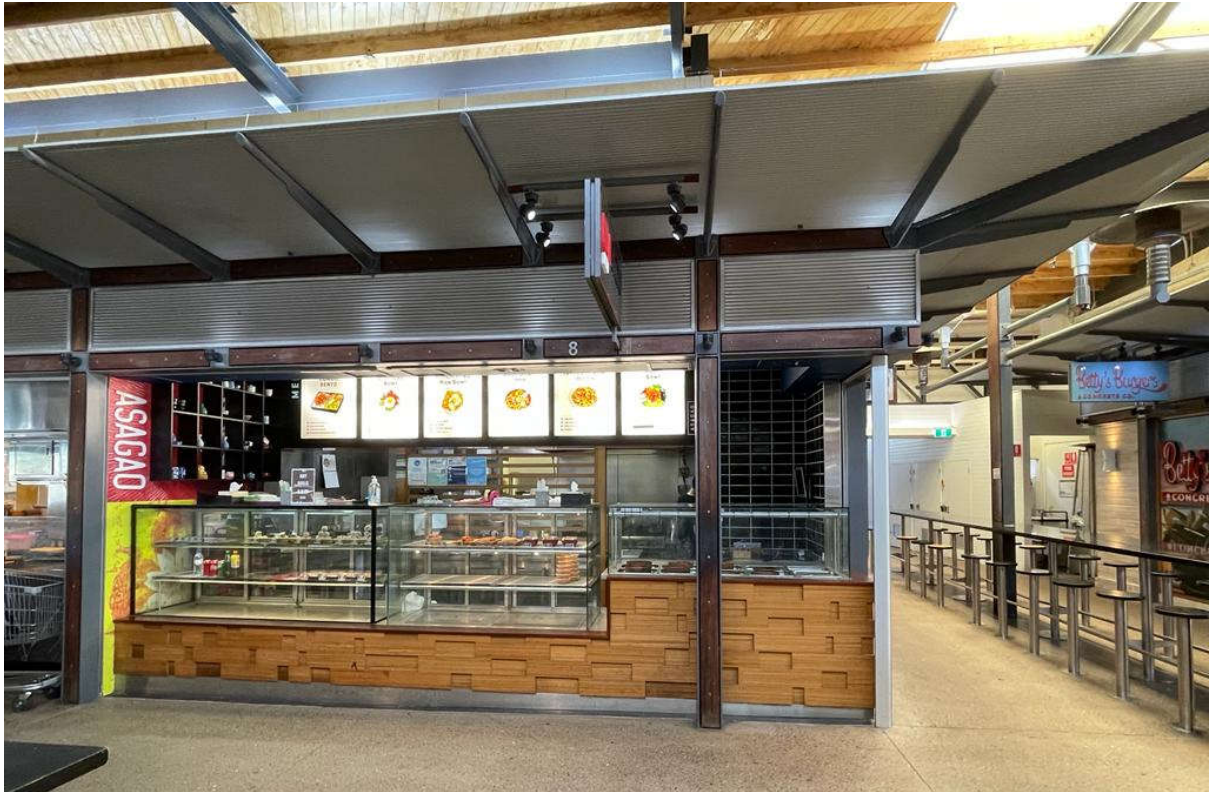
Figure 3: Photo of existing tenancy