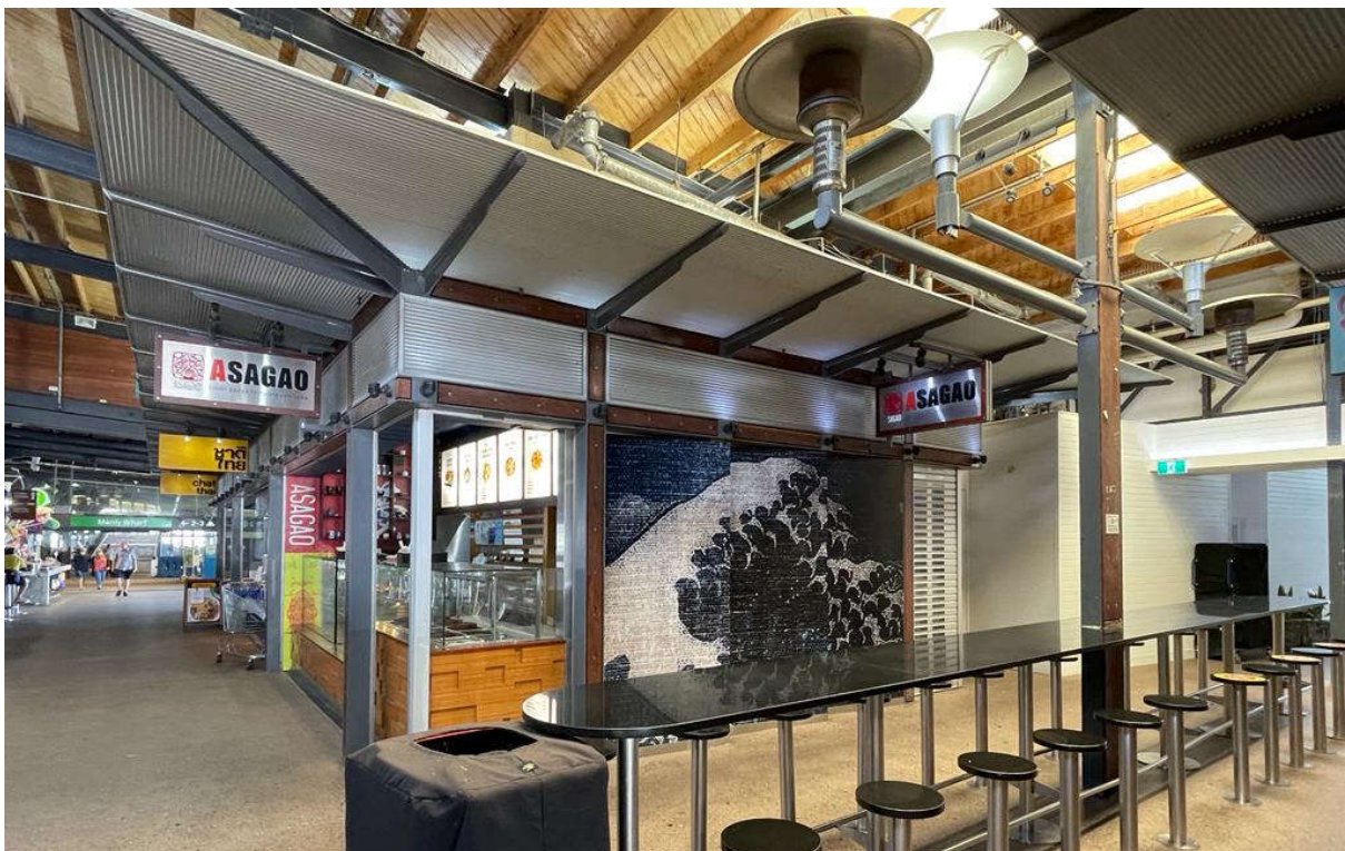
Figure 4: Photo of existing tenancy