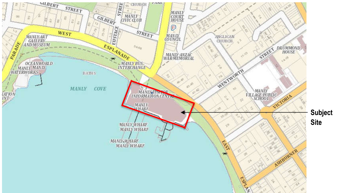
Figure 1: Location Map

Manly Wharf is located on East Esplanade and the subject site is located on the northern side of the wharf as illustrated in Figure 1 & 2 below. The Southern side of the Manly Wharf is used as the ferry terminal. The northern side is a two- storey building with a vast range of commercial and retail tenancies including restaurants, cafes, supermarket and other retail stores. The subject tenancy, shop 8, is located on the ground level / internal area of the northern side of the wharf which is not visible from the public from East Esplanade nor Fairlight Walk. Pedestrian can access by walking from East Esplanade to the ferry terminal or vice versa.