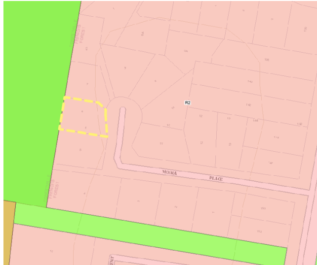
Extract of Zoning Map

The Warringah Local Environmental Plan 2011 (LEP 2011) came into effect on Friday 9 December 2011.