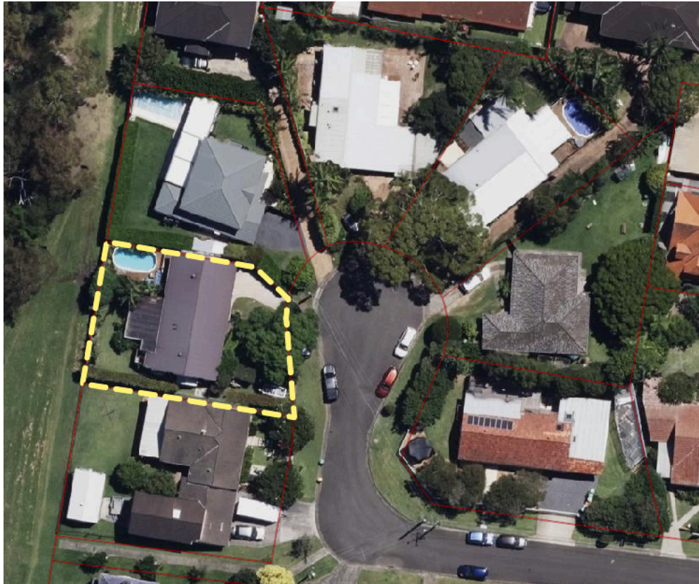
Aerial Photograph of Locality