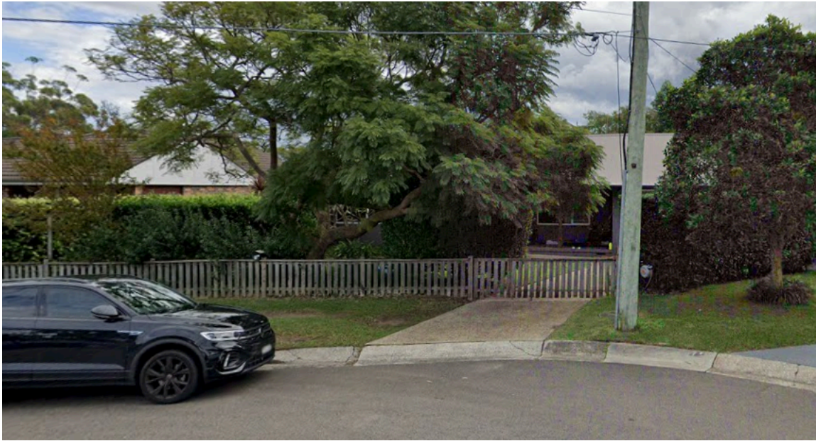
View of Site from Moira Place

The existing surrounding development comprises a mix of one and two storey detached residential dwellings on varied sized allotments. The site is located towards the end of a cul de sac with a number of properties having splayed boundaries and varied setbacks to the street frontage.