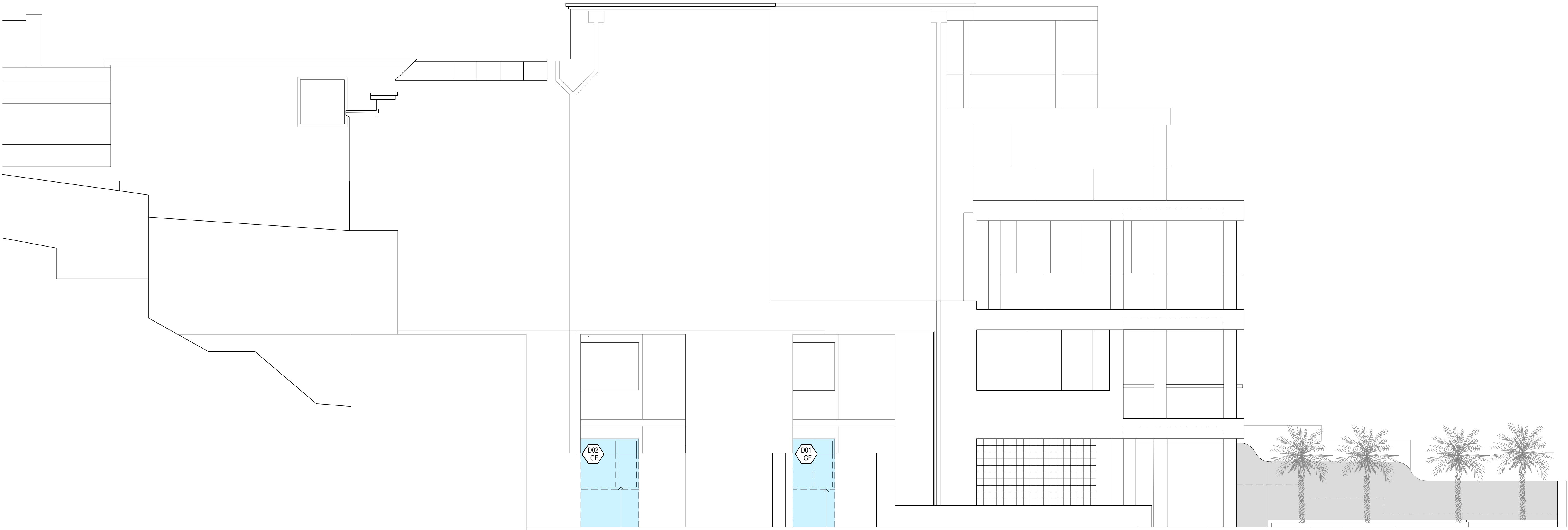
1 PROPOSED WEST ELEVATION- UNIT 1 scale - 1:50 @ A1, 1:100 @ A3