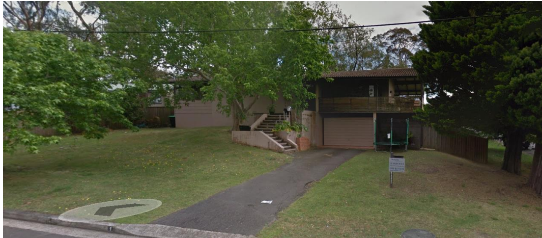
Neighbouring Eastern Dwelling