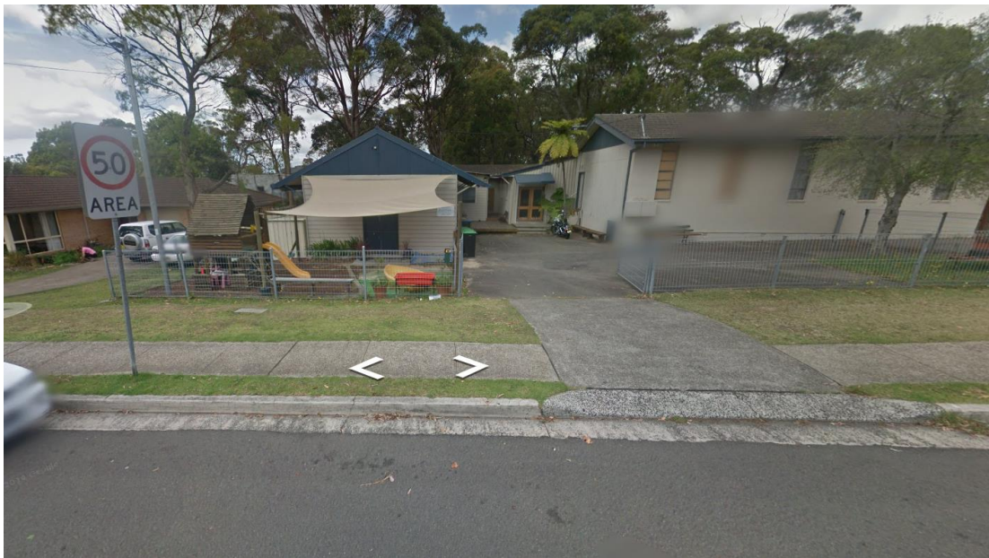
Neighbouring Dwellings opposite