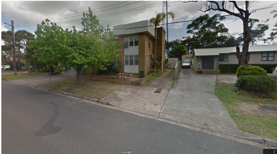
Neighbouring Western Dwelling