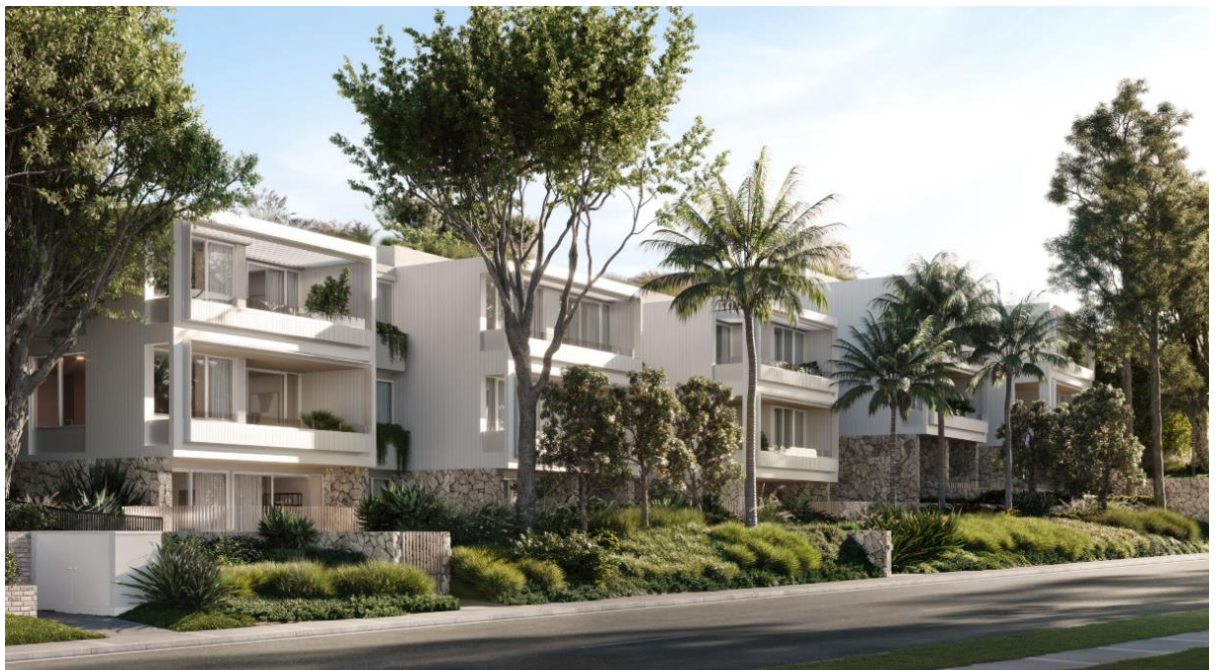
Figure 3 - Photograph montage of proposed development as viewed from Beaconsfield Street confirming that the non-compliant lift overruns will not be readily discernible in a streetscape context with the overall height, bulk and scale consistent with that established by the immediately adjoining residential flat building