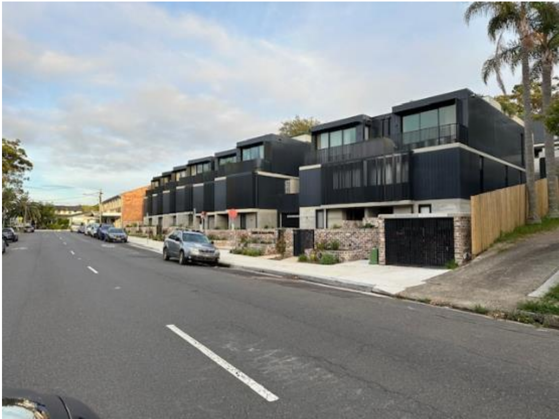
Figure 2 - Photograph of recently completed western adjoining residential flat building 60 Beaconsfield Street