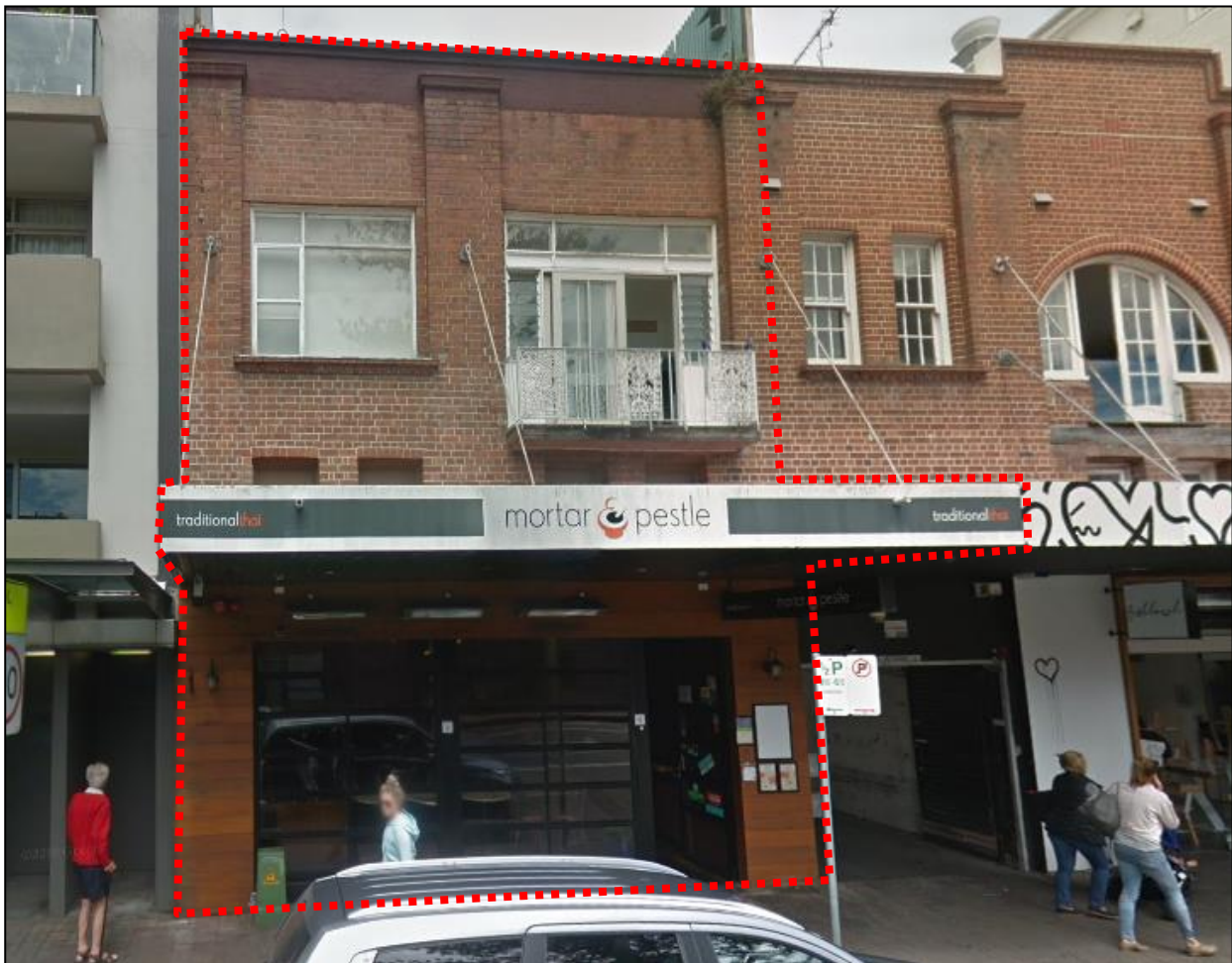
Figure 03: Neighbouring property at No. 2 Darley Road

Neighbouring the subject site to the south-east is a three storey mixed use building constructed primarily of brick finish with flat roofing. A commercial premise comprising a Thai restaurant is located on the ground and mezzanine levels, with a residential unit located above. Pedestrian access is via Darley Road.