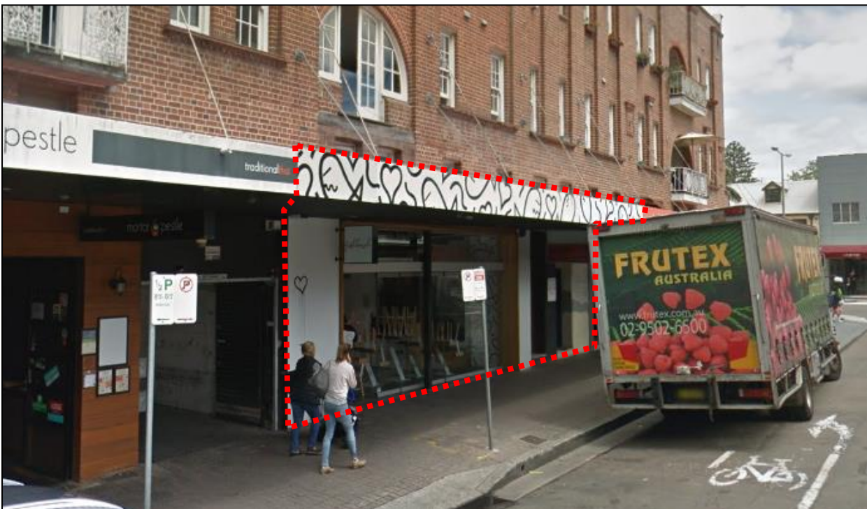
Figure 02: Subject Site at No. 8/38-42 The Corso

The use for the site is currently commercial. Under DA142/2008, approval was granted for the fit-out of a new chicken shop known as Firebird to which no changes in use have been made since. At present, an unauthorised restaurant known as Fishbowl is operating, for which this application seeks approval.