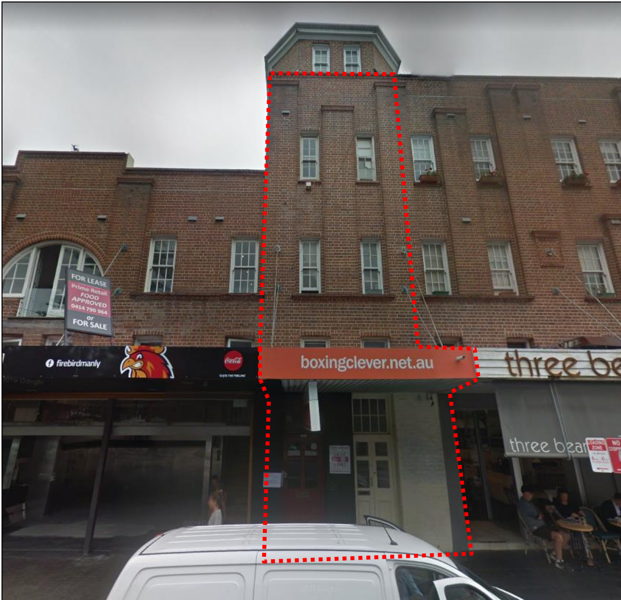
Figure 04: Neighbouring property at No. 7/2C Darley Road

Neighbouring the subject site to the north-west is a four storey mixed use building constructed of brick finish with flat roofing. A public relations agency is located on the ground floor with residential units located on the floors above. Pedestrian access is via Darley Road.