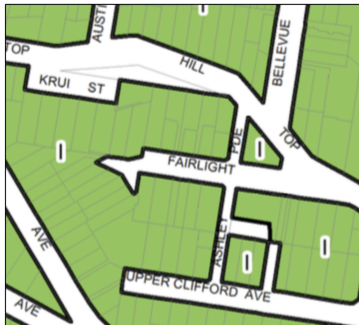
Figure 2 Manly LEP 2013 Height Map

Refer to Figure 1 below for Height Map noting I is 8.5m.