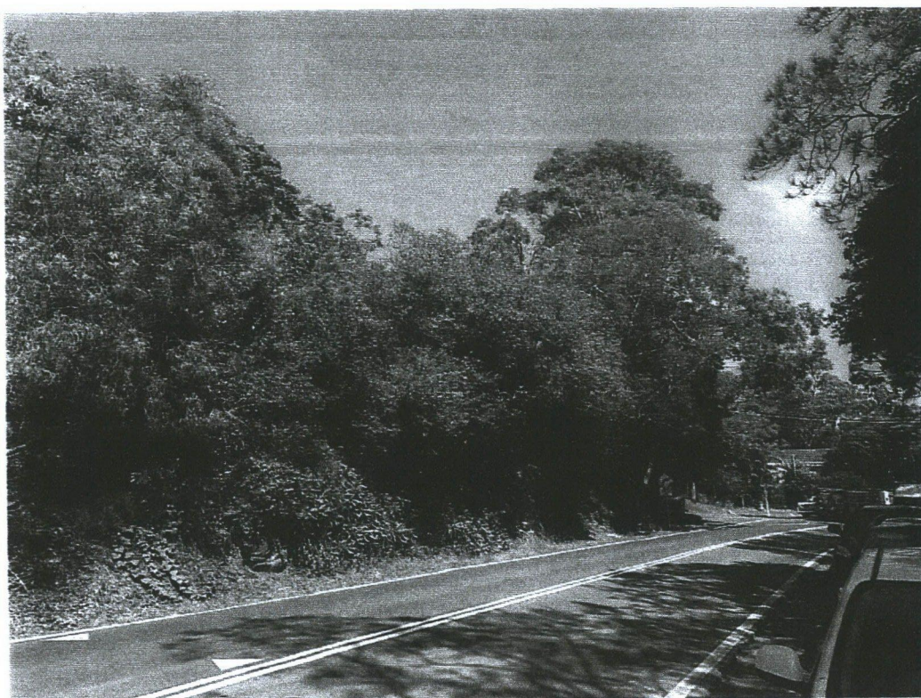
Fig 6: View of Pittwater Road streetscape, looking north-west