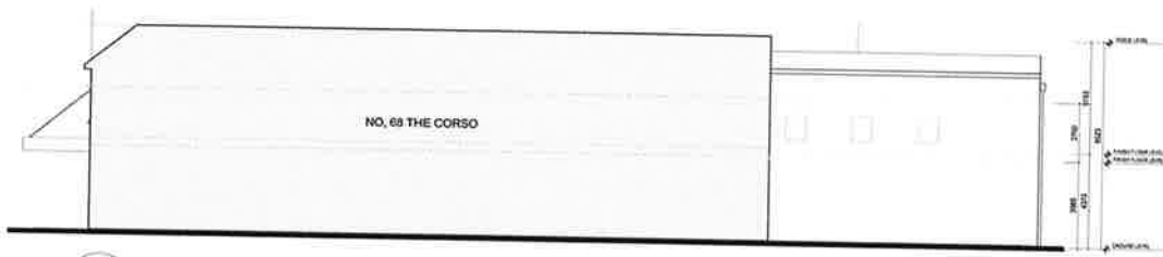
1 SIDE ELEVATION - WEST A1.5