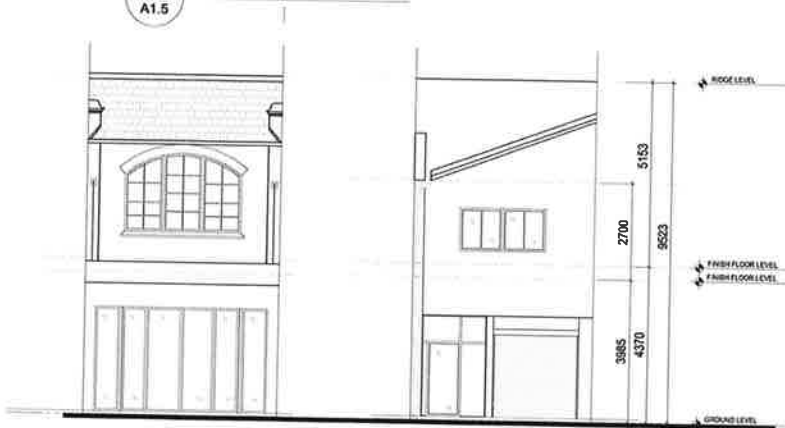
1 FRONT ELEVATION A1.5 SCALE = 1:100