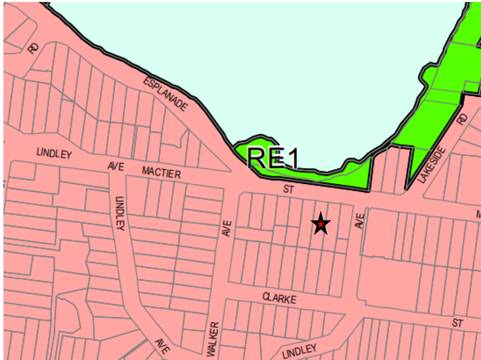
Extract of Zoning Map

The Warringah Local Environmental Plan 2011 (LEP 2011) came into effect on Friday 9 December 2011.