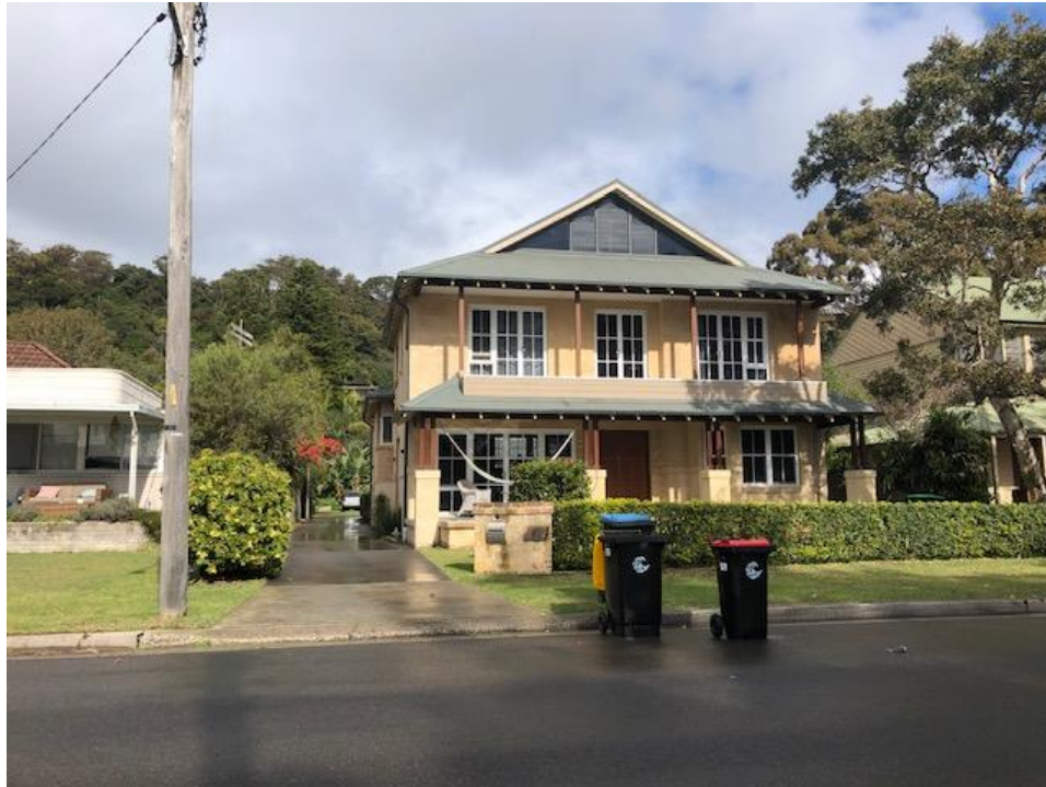
View of No. 64 Mactier Street

The compatible form and scale of the new dwelling will meet the housing needs of the community within a single dwelling house which is a permissible use in this low density residential zone.