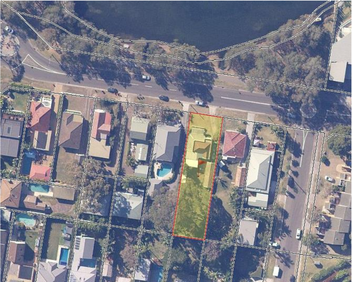
Aerial Photograph of Locality