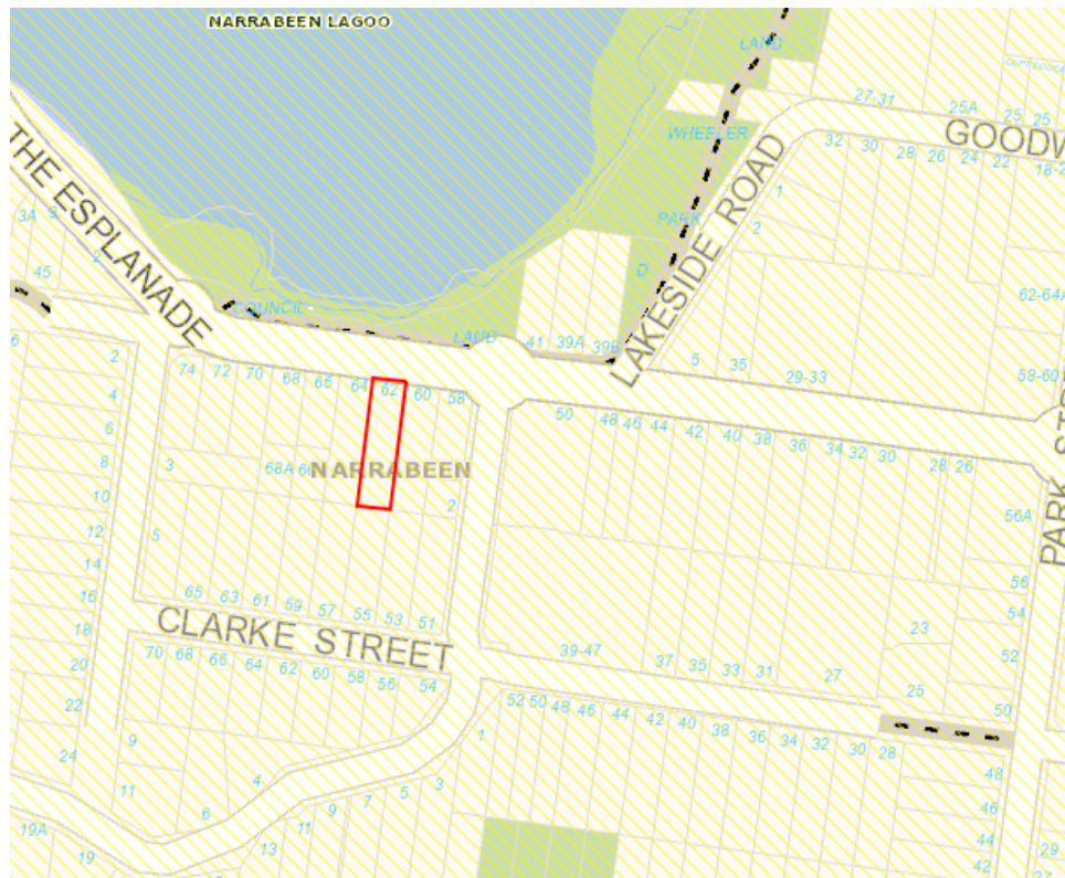
Extract of SEPP (Coastal Management Map)

This SEPP aims to manage development in the coastal zone and protect the environmental assets. The subject site is identified as 'coastal environment area' and 'coastal use area' on the Coastal Management Map and therefore the provisions of this SEPP apply. The following Clauses are relevant to the proposed development: