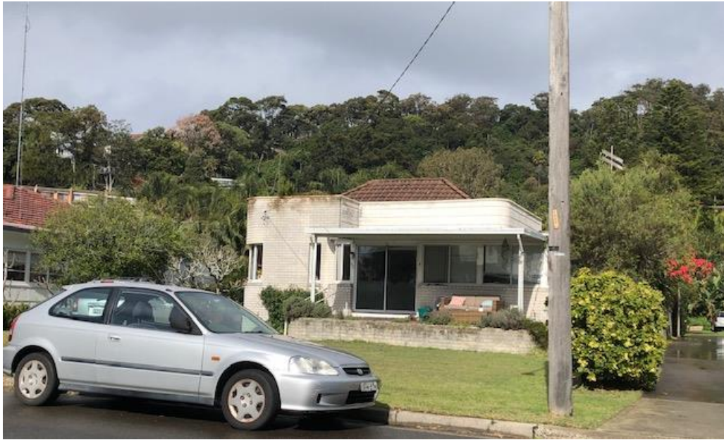
View of Subject Site from Mactier Street

The existing surrounding development comprises a mix of one and two storey detached residential dwellings on generally similar sized allotments to the subject site, interspersed with some three storey residential flat buildings. More recent development comprises larger two storey dwellings of modern appearance.