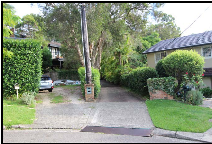
Fig 6: No. 4 Mulawa Place as seen from Mulawa Place ( Google maps 2019 ).