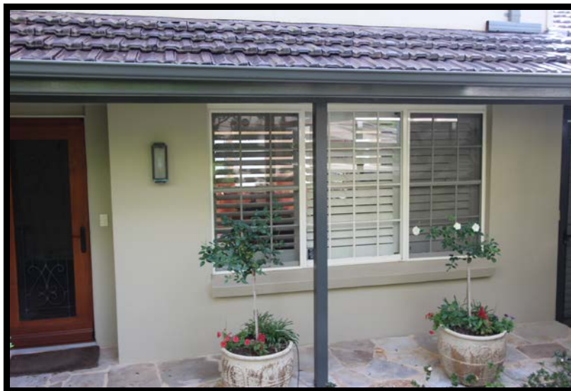
Fig 3: Paved front porch area. ( Action Plans 2019 ).