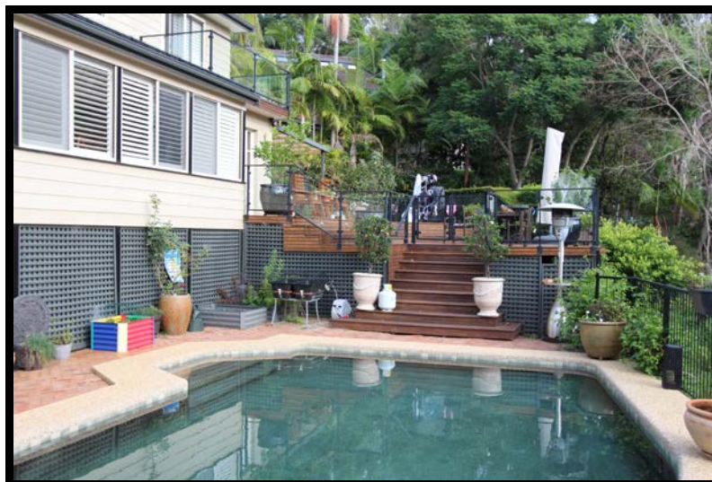
Fig 4: View of the rear decked area and pool. ( Action Plans 2019 ).