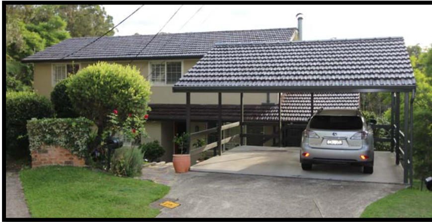
Fig 2: 5 Mulawa Place as seen from the street. ( Action Plans 2019 ).