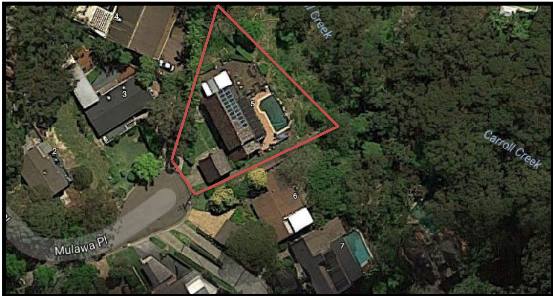
Fig 1: Subject site outlined in red (Google maps 2019).

The site slopes gently from South to North.