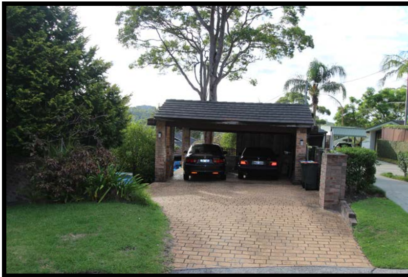
Fig 5: No. 6 Mulawa Place as seen from Mulawa Place ( Action plans 2019 ).

The surrounding area predominantly consists of single or two storeys residential dwellings. The adjoining property to the south, 6 Mulawa Place, is a brick residence with a tiled roof and vehicular access from Mulawa Place. To the north, 4 Mulawa Place, is a double storey brick residence with tiled roof. The property has vehicular access from Mulawa Place.