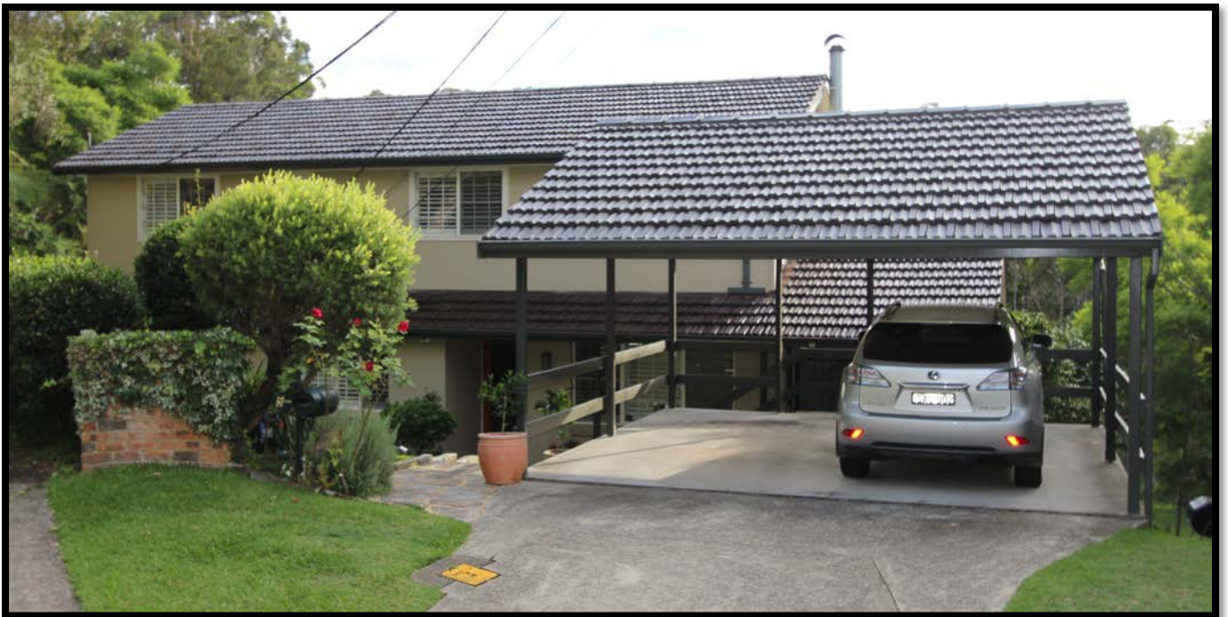
No. 5 MULAWA PLACE, FRENCHS FOREST NSW 2086 STREET VIEW

DEVELOPMENT APPLICATION FOR ALTERATIONS AND ADDITIONS AT 5 MULAWA PLACE, FRENCHS FOREST NSW 2086