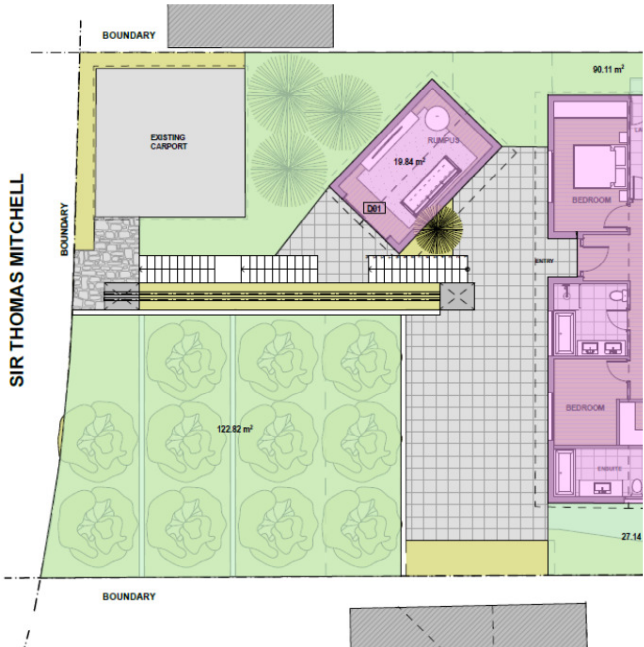
Fig. 3 Area Calculations Plan extract. Terrace walls indicated?