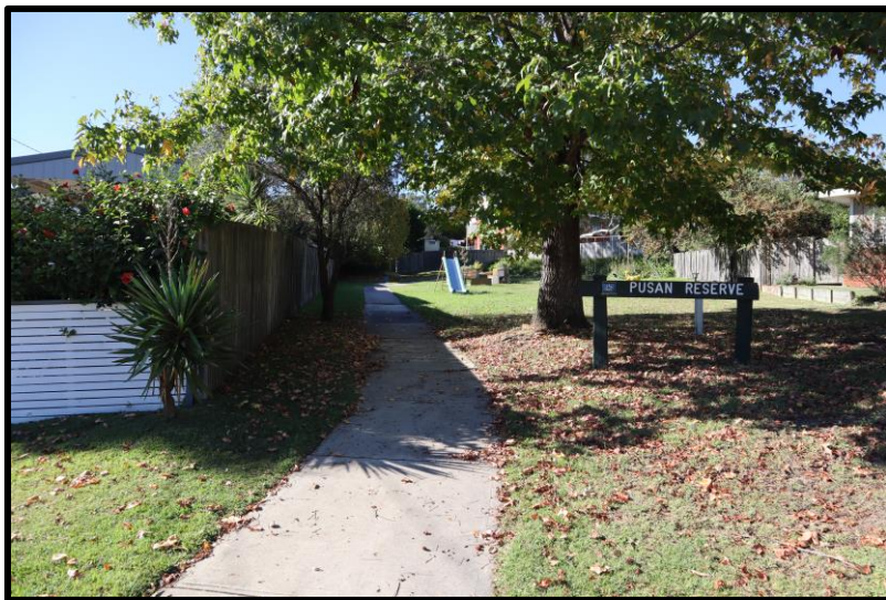
Fig 6: Pusan Reserve as seen from Pusan Place ( Action Plans 2019 ).