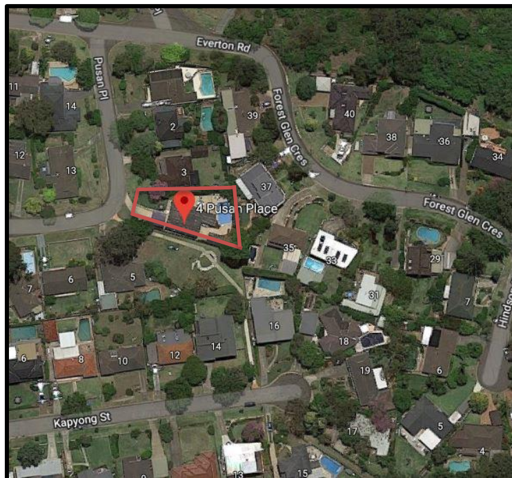
Fig 1: Subject site outlined in red (Google maps 2019).

The site slopes gently from east to west.