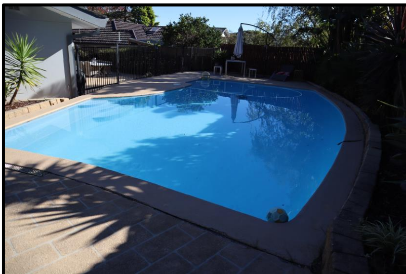
Fig 4: View of the entertaining/pool area. ( Action Plans 2019 ).