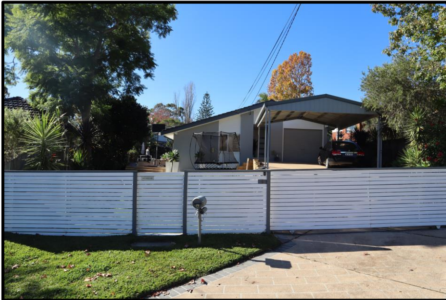
No. 4 PUSAN PLACE, BELROSE, 2085 view from Street (Action Plans 2019)

DEVELOPMENT APPLICATION FOR ALTERATIONS AND ADDITIONS AT 4 PUSAN PLACE, BELROSE NSW 2085