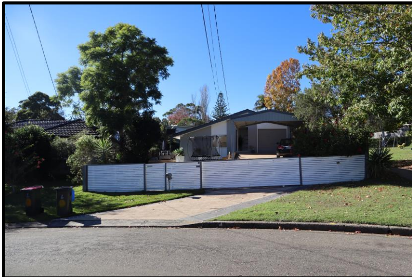
Fig 2: 4 Pusan Place as seen from the street. ( Action Plans 2019 ).