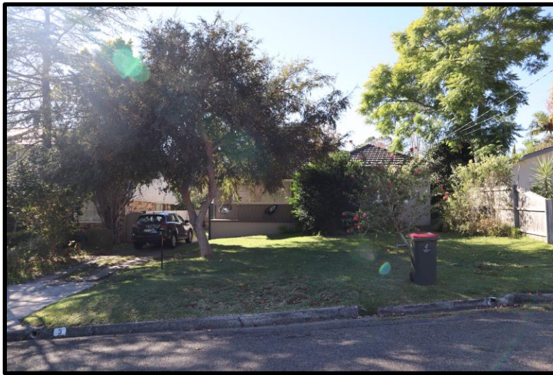
Fig 5: No. 3 Pusan Place as seen from Pusan Place ( Action Plans 2019 ).

To the south, Lot 38 DP 223046, is a public open space known as Pusan Reserve which is a grassed open area with childrens play equipment and a concrete path linking Pusan Place with Kapyong Street.