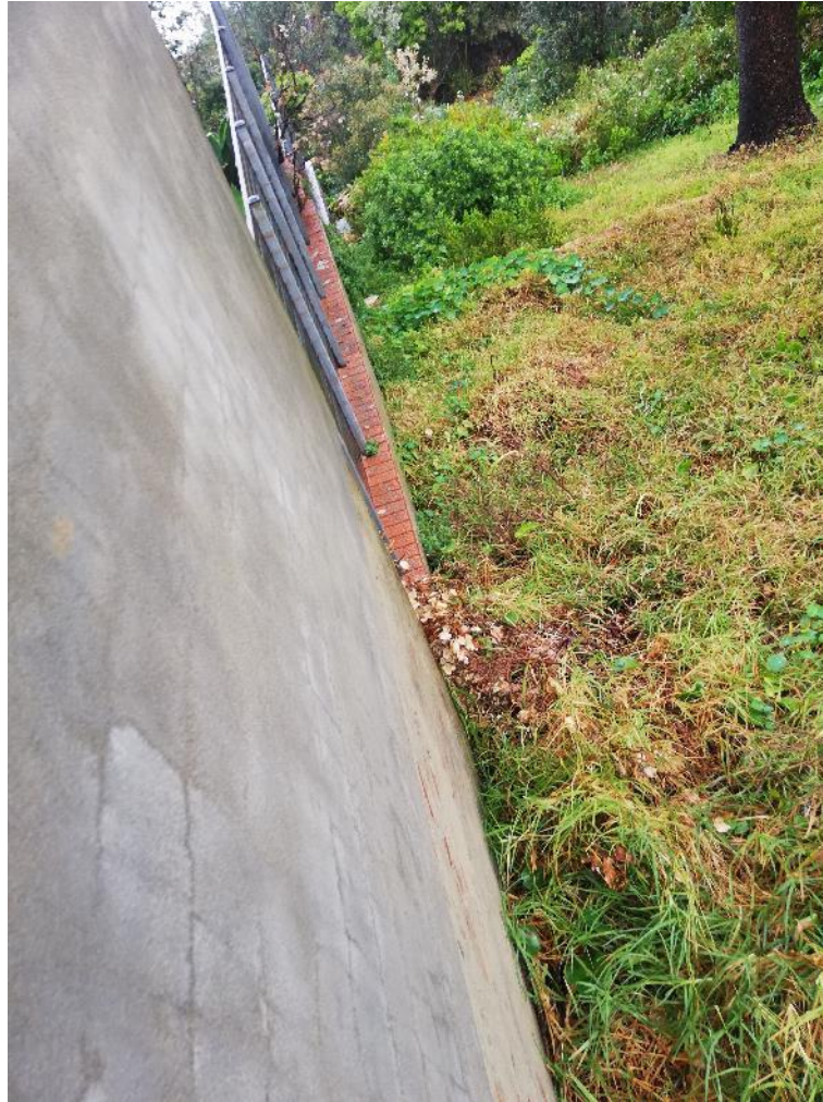
Image 4. View of Retaining Wall Render From Neighbouring Property