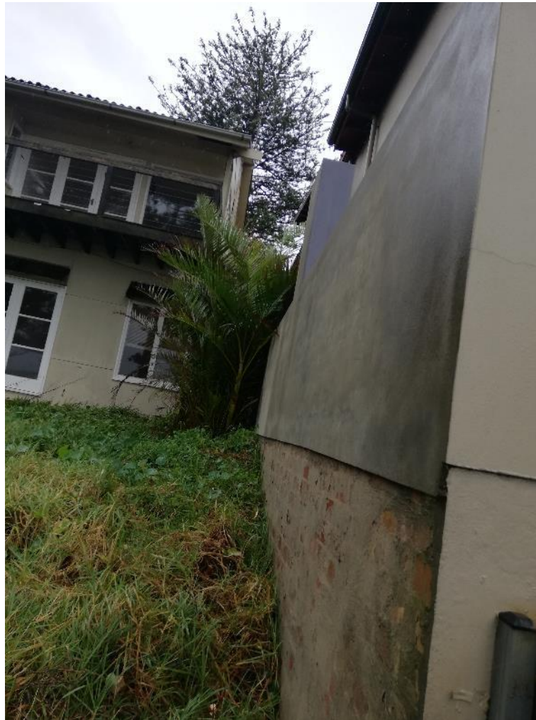
Image 5. View of Retaining Wall Render From Neighbouring Property