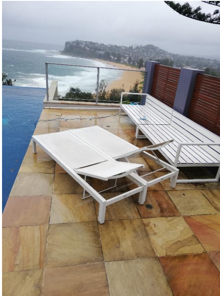
Image 7. View of Suspended Slab Adjacent to Pool Area