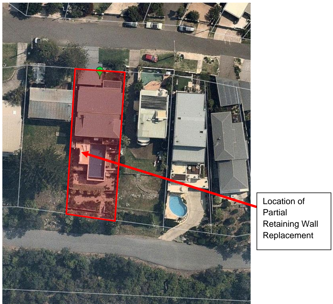
Figure 2.1 – Location of the Subject Property and Proposed Retaining Wall Reconstruction