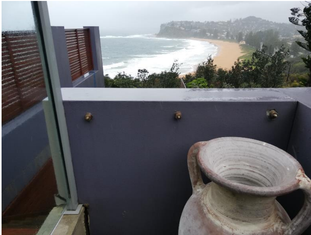
Image 3. View of Existing Retaining Wall Upturn and Colour to be Matched