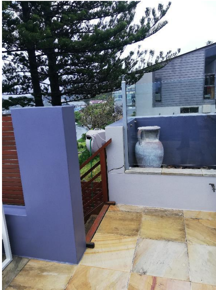
Image 6. View of Retaining Wall and Slab on Ground that Will Require Removal and Replacement