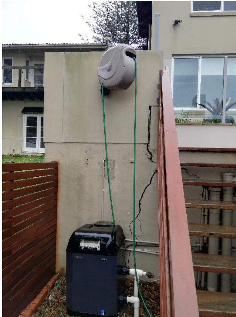
Image 1. View of Retaining Wall to be Replaced