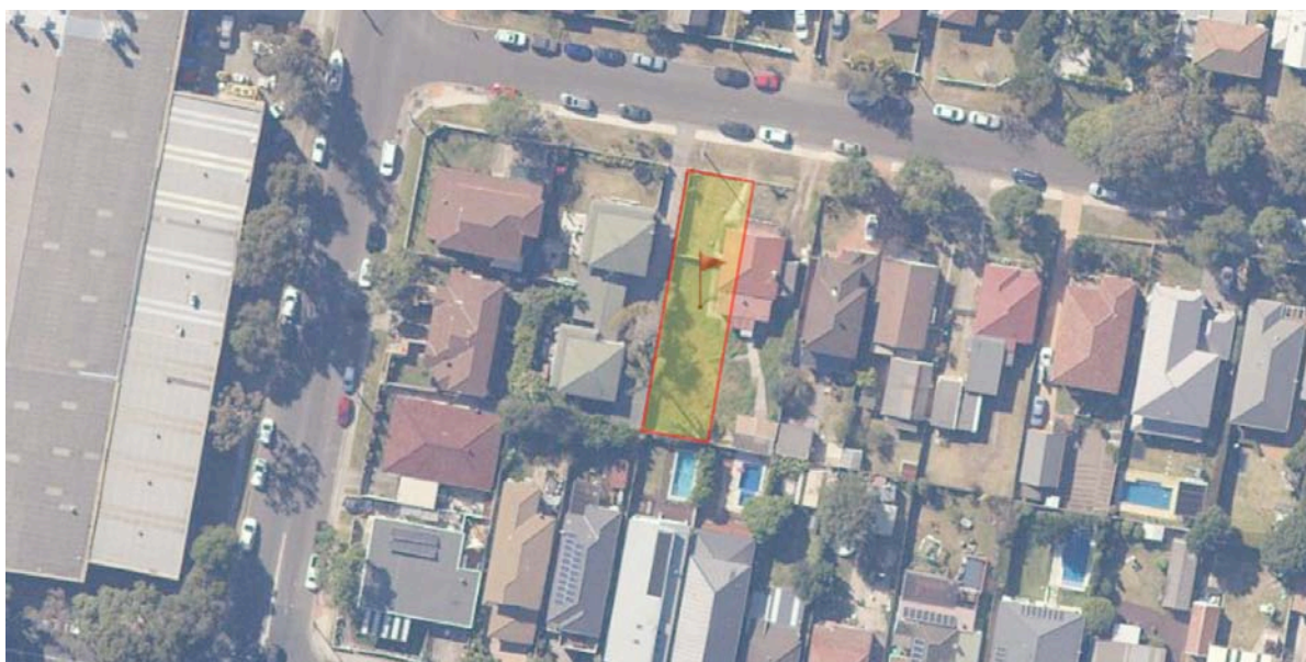
Subject Site: 51 Amourin St North Manly

The site is surrounded on both sides by detached dwelling houses.