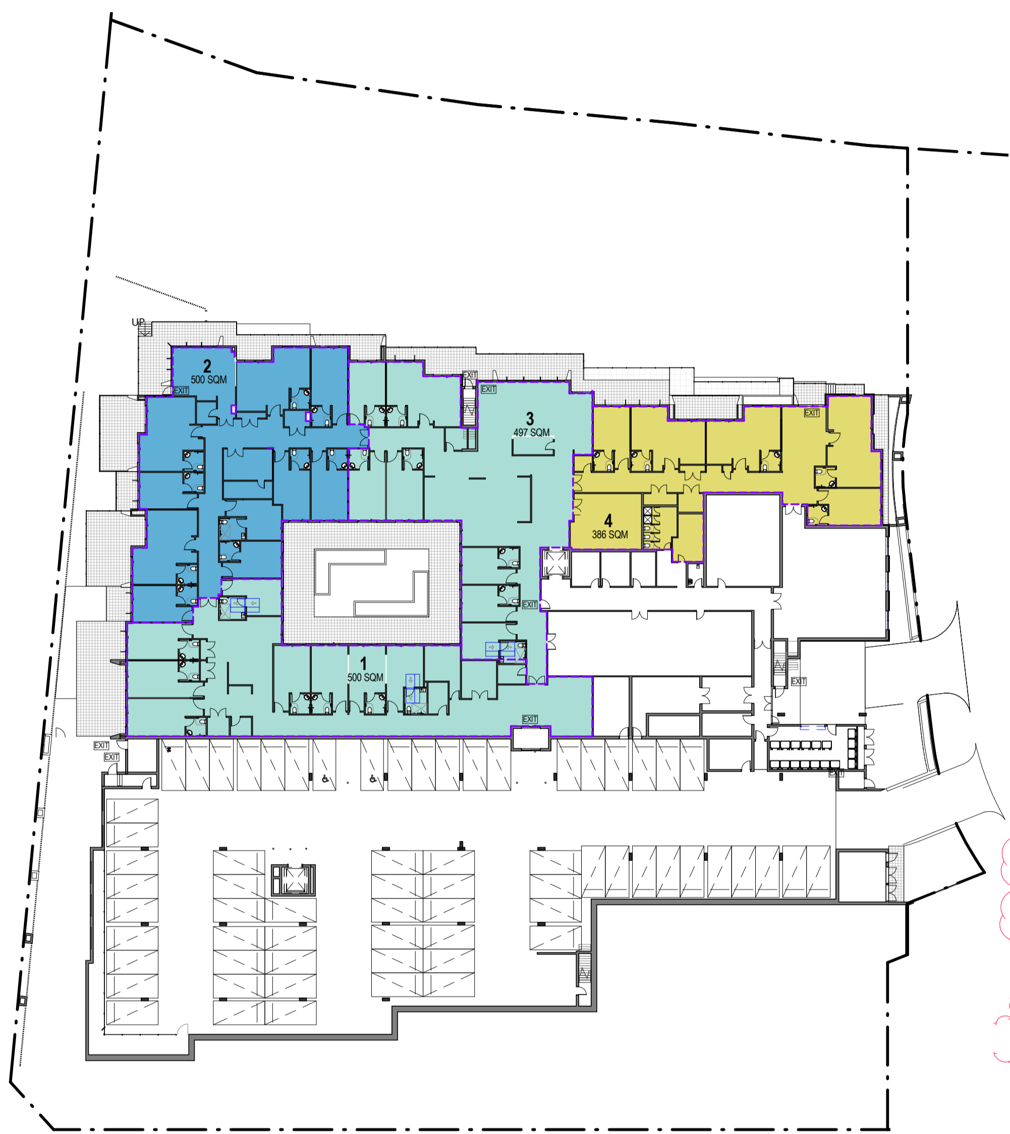
3 LEVEL B1 - SMOKE COMPARTMENT DA-104 1:400