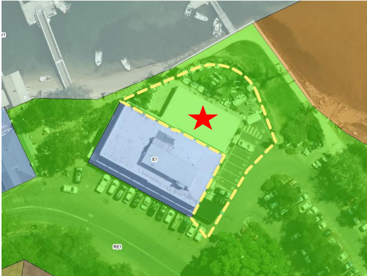
Figure 1 – Subject lot and immediate surrounds

The site is occupied by a single storey structure used in association with the restaurant component of the Pasadena which operates pursuant to a 1961 development consent and subsequent 1963 building approval. The subject allotment is depicted by a yellow dotted line in the aerial/ zoning overlay image below. The structure the subject of this application is depicted by red star.