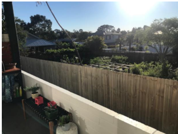
Picture 2 - View I am currently getting from my balcony.