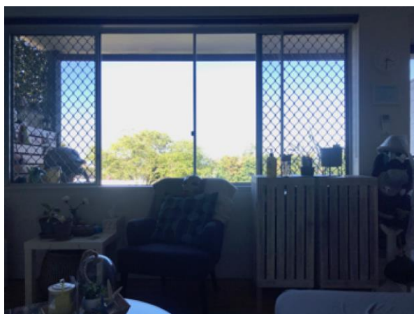
Picture 3 - View directly from my couch in my lounge room.