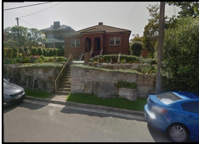
Fig 5: No. 29 Carlton Street as seen from Carlton Street.

The surrounding area predominantly consists of single or two storeys residential dwellings. The adjoining property to the South, 29 Carlton Street, is a two storey brick residence duplex with a tile roof and vehicular access from Carlton Street. To the north, 35 Carlton Street, is a single storey weatherboard residence with a metal roof. The property has vehicular access from Carlton Street.