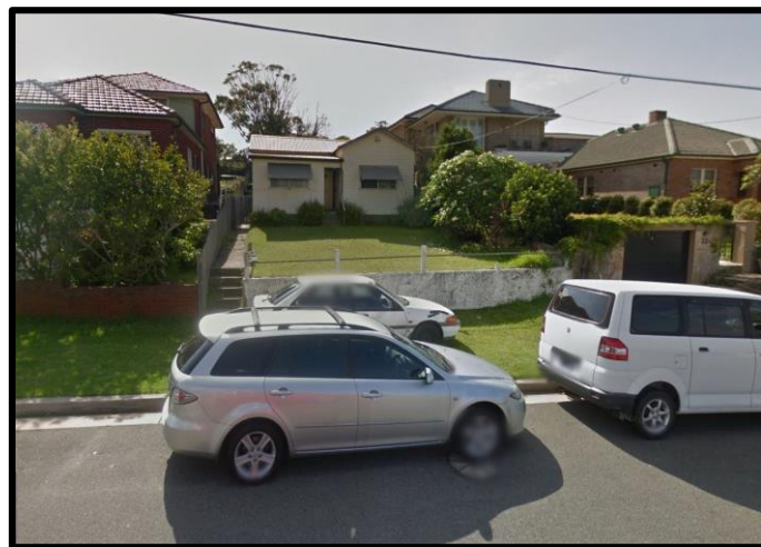
Fig 6: No. 35 Carlton Street as seen from Carlton Street.