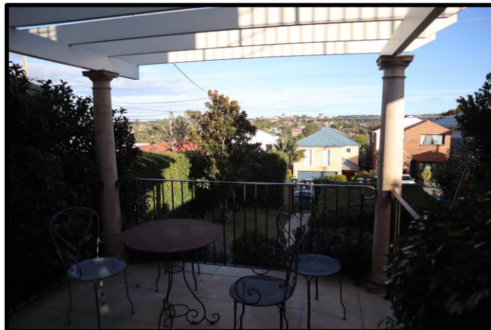
Fig 3: Paved front terrace area. ( Action Plans 2019 ).