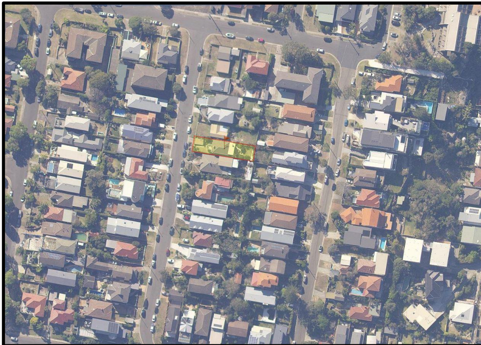
Fig 1: Subject site outlined in red (SIX maps 2019).

The property currently accommodates a two storey dwelling with a double car garage. The existing house is constructed in rendered brick and has a tiled roof.