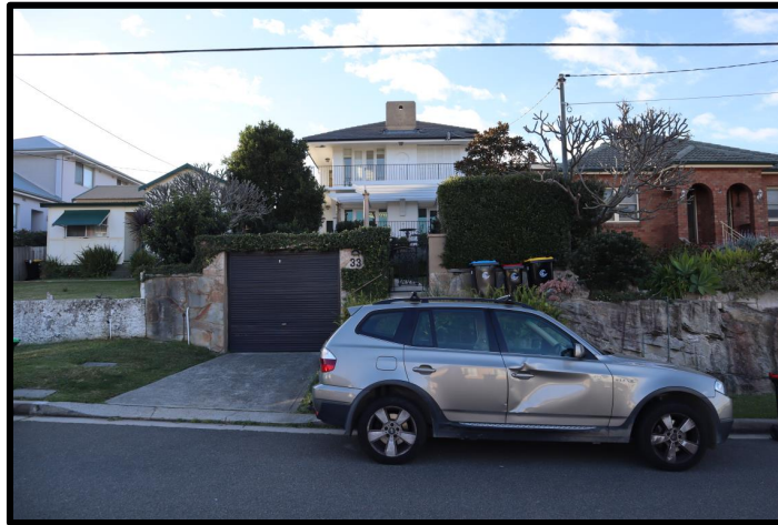
Fig 2: 33 Carlton Street as seen from the street. ( Action Plans 2019 ).