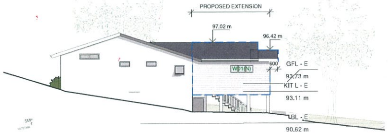
3 | NORTH ELEVATION - NP 1 : 200