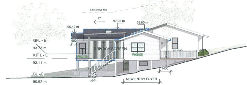
4 | SOUTH ELEVATION - NP 1 : 200

Do not scale from plans. All dimensions and levels shown on plan are subject to confirmation on site.