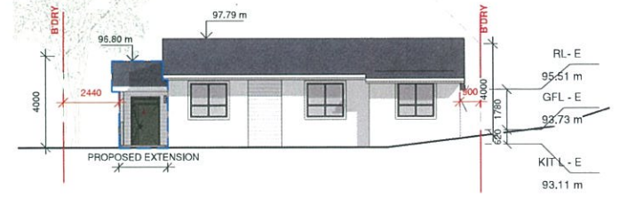
2 | EAST ELEVATION - NP 1 : 200