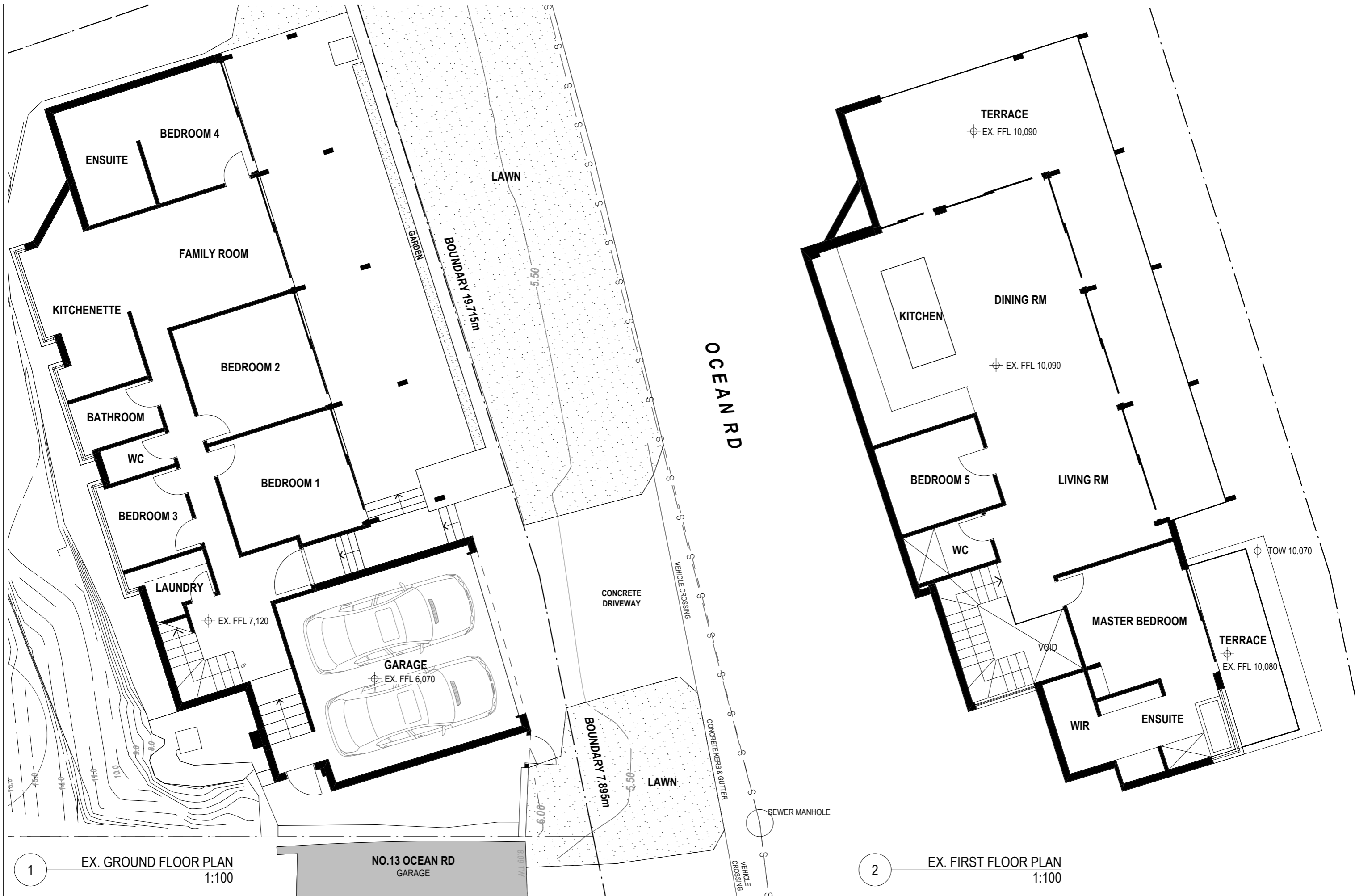
1 EX. GROUND FLOOR PLAN 1:100