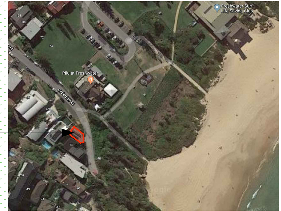
(A) LOCATION PLAN N.T.S.