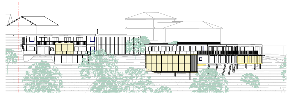
2 NOTIFICATION EAST ELEVATION DA99 SCALE: 1 : 500