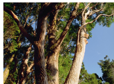
EU EUCALYPT TREE Eucalyptus Robusta