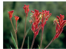
AG KANGAROO PAW Anigozanthos Gabriellae