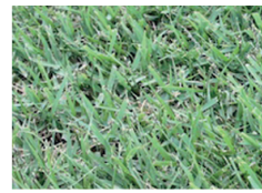
LAWN (L) NARA NATIVE TURF Nara Zoysia

THIS SELECTION OF HIGH QUALITY ENDEMIC NATIVE PLANT SPECIES WILL BE USED TO LANDSCAPE THE STREET FRONTAGES WITH DEEP SOIL PLANTING PARTICULARLY USING EUCALYPT TREES (SEVEN OF).