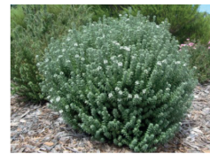
WF COASTAL ROSEMARY Westringia fruticosa