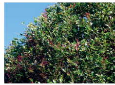
AS SMALL-LEAF LILLY PILLY Acmena smithii 'Hot Flush'