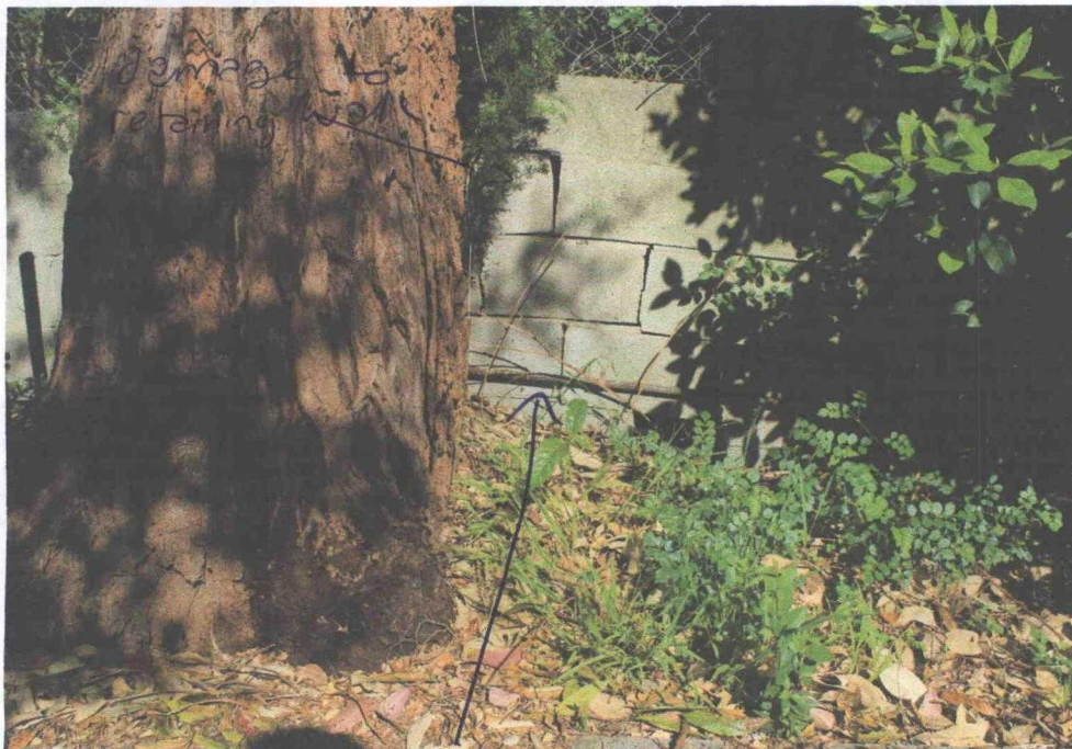
previous "patch" job on water line