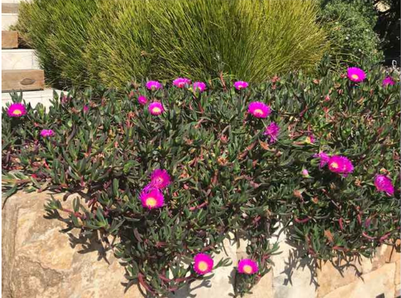
CASCADING PLANTING OVER ROCK OUTCROPS