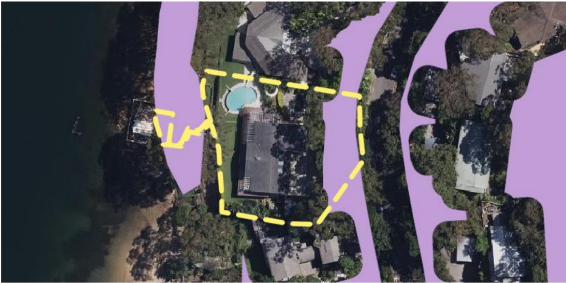
Figure 1 Biodiversity Values Map – 316 Hudson Pde Clareville

However, the proposed new work that is in the purple mapped area is minor and does not impact significant vegetation_refer Figure 3_Architectural Plan DA.0102. The proposed work is similar to previously approved DA & CC works_refer Figure 2_CC approved Plan. Further, none of the trees in the subject site area are native protected (prescribed) trees.