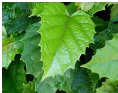
Cissus antarctica Kangaroo Vine