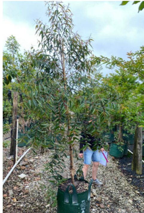
Angophora costata Smooth Barked Apple