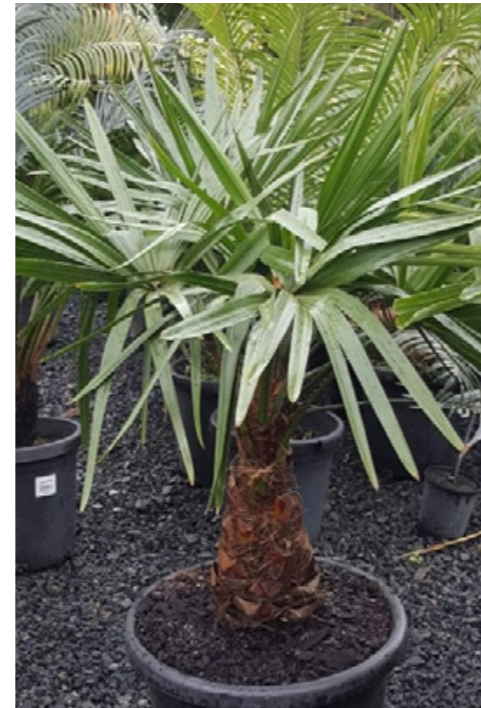
Livistona australia Cabbage Tree Palm