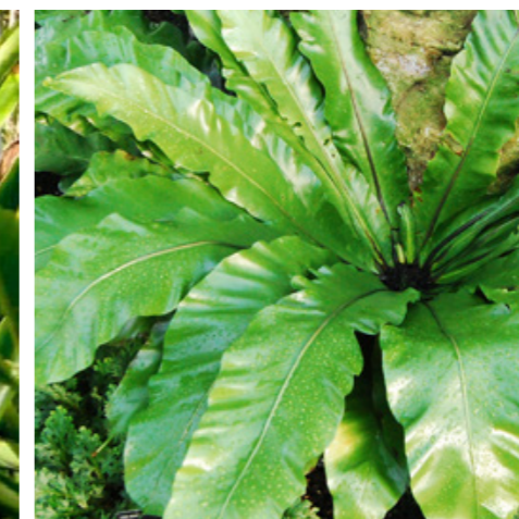
Asplenium australasicum BIRDS NEST FERN