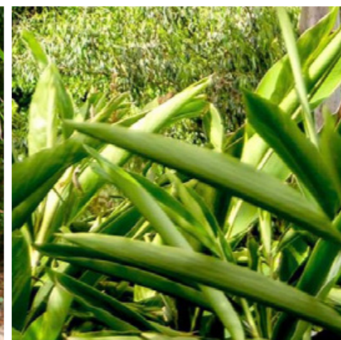
Alpinia caerulea NATIVE GINGER