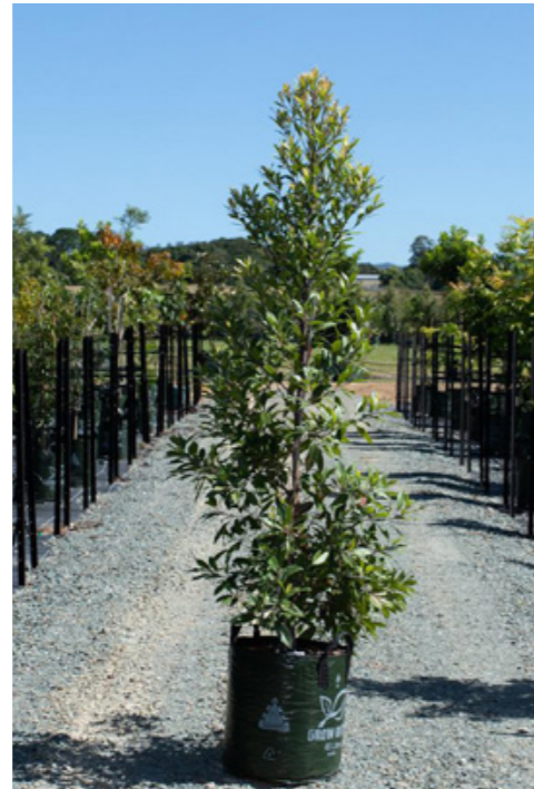
Eleocharpus reticulatis Blueberry Ash