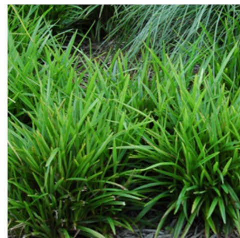
Dianella caerulea FLAX LILY