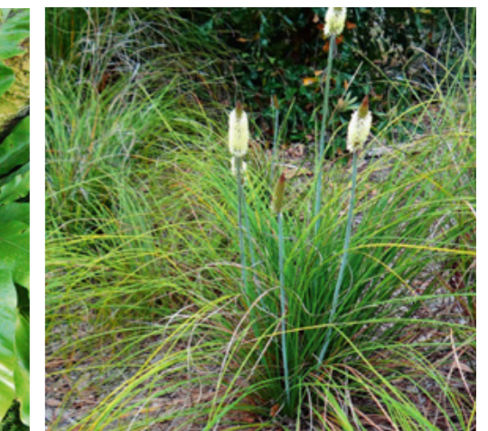
Xanthorrhoea macronema GRASS TREE