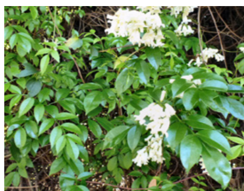
Pandorea pandorana Wonga Wonga Vine

Species selection is based on suitability to site conditions and accordance with Endangered Ecological Communities of Pittwater Spotted Gum Forest and East Coast Littoral Rainforest as listed by the Department of Environment & Climate Change NSW and the NSW Department of Planning, Industry and Environment.