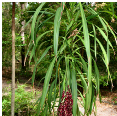
Cordyline congesta PALM LILY