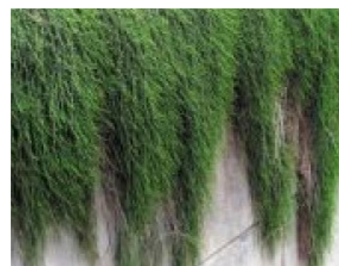
Casurina glauca prostrate Cousin itt