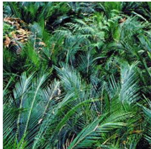
Macrozamia macronema Burrawang